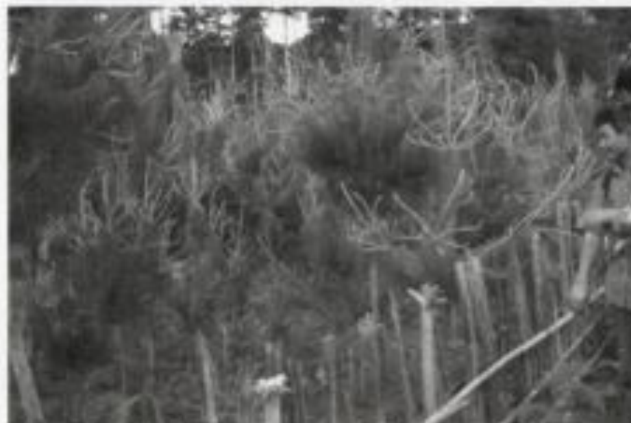
Figure 5. Late-rotation plantation

Takhe Gumbo owns four plantations, the largest of which