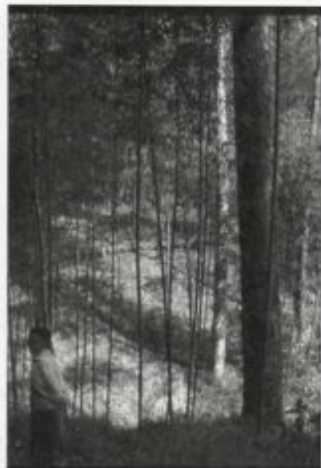
Figure 4. Private plot

The Tatu family manages a 1.0 ha plantation not far from their house in Siso. In the winter of 1999 the plantation was mapped and the resources surveyed. The plantation was established in